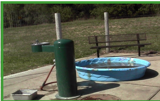
Water service is provided at the dog park.